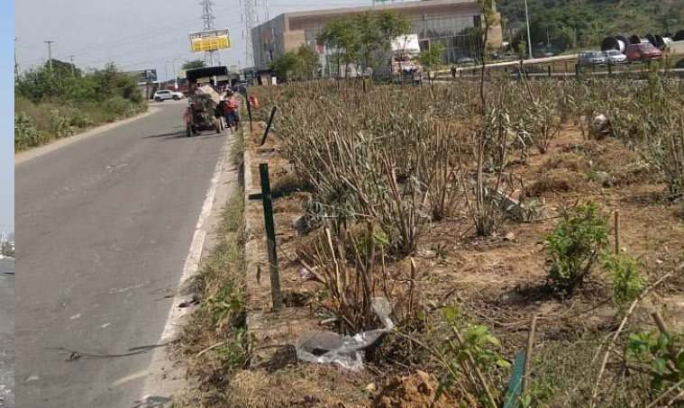
ACTUAL IMAGES OF SECTOR 76 & 77