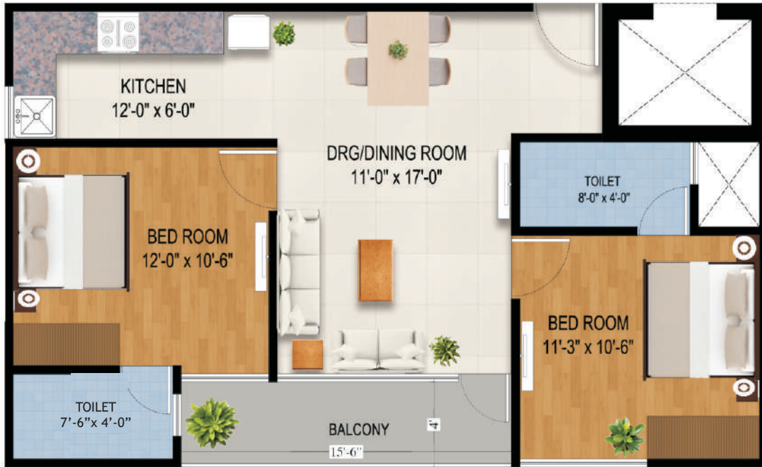
2 BHK / 1100Sqft