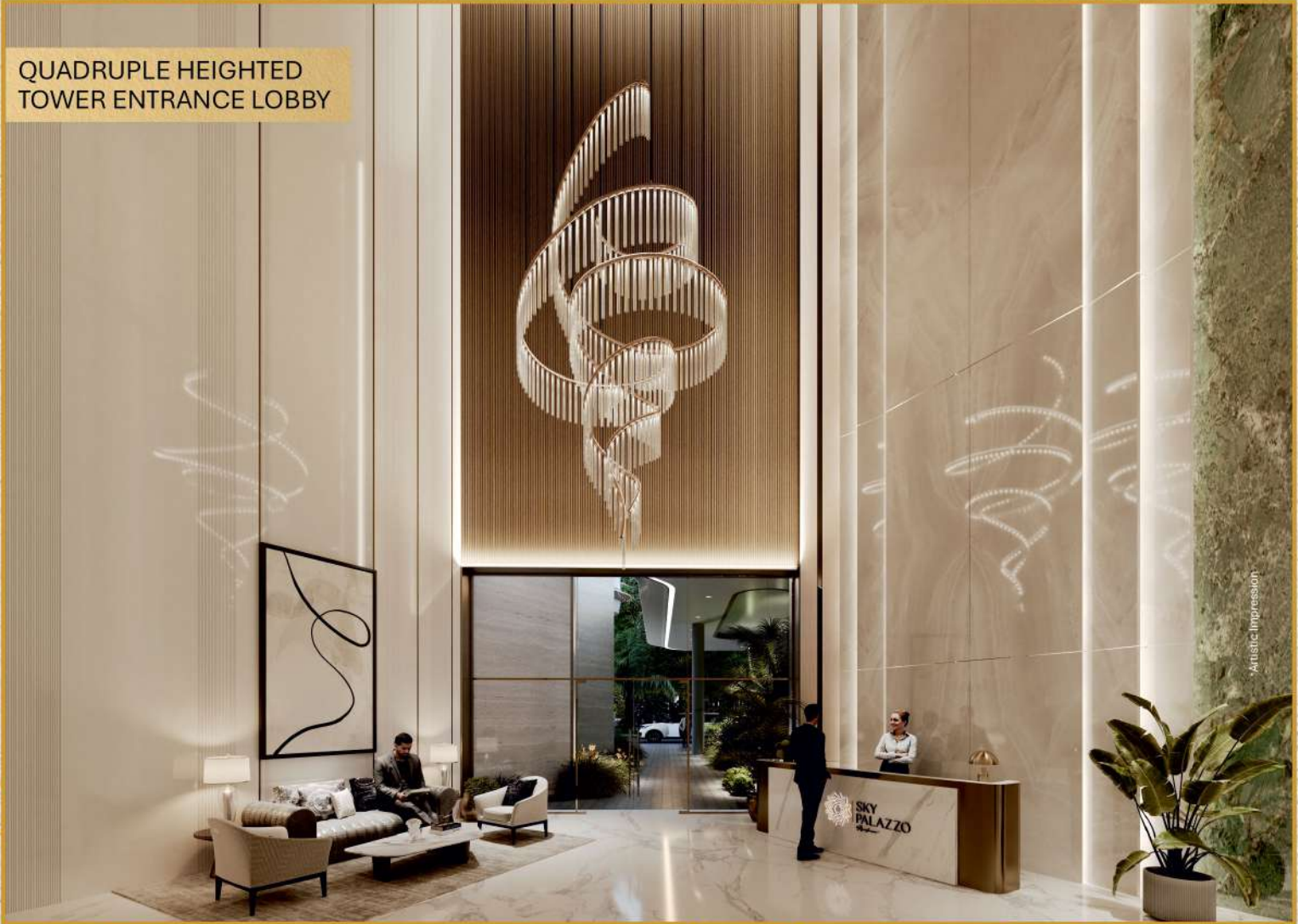
QUADRUPLE HEIGHTED TOWER ENTRANCE LOBBY